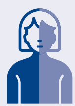
Sudden numbness or paralysis of the face, arm or leg